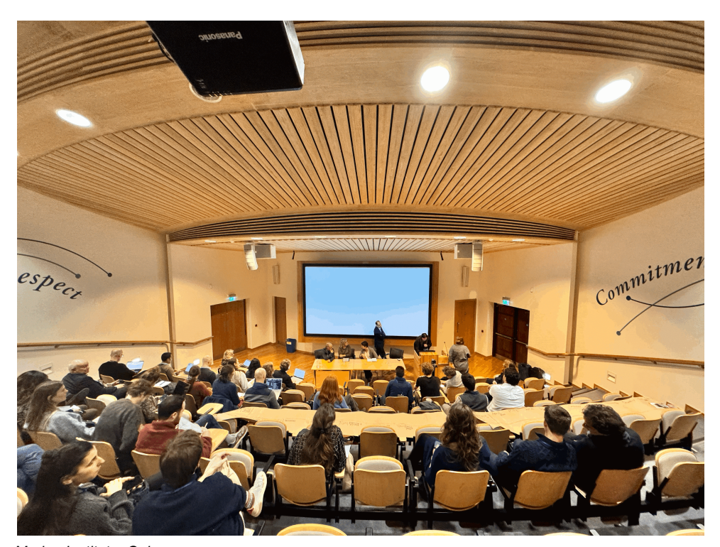
Marine Institute, Galway