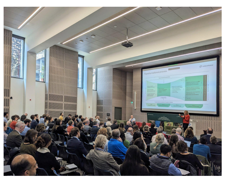
Trinity Business School, Dublin

The day closed with three parallel sections, each dedicated to driving the transition towards a nature-positive economy: