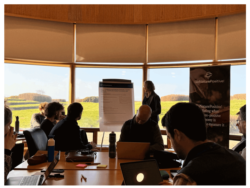
Marine Institute, Galway

contributing. We ended the day with a site visit to \underline{\text{BIA}} in Athenry, who are dedicated to transforming food chains towards Regenerative Agriculture.